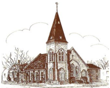
Franklin Presbyterian Church Franklin, Kentucky

Franklin Presbyterian Church 201 North College Street Franklin, KY 42134