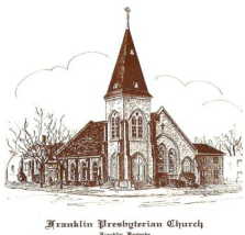
Franklin Presbyterian Church Franklin, Kentucky

Do you have something to go in the Lamplighter? Submit it to the office by the last Thursday of the month.